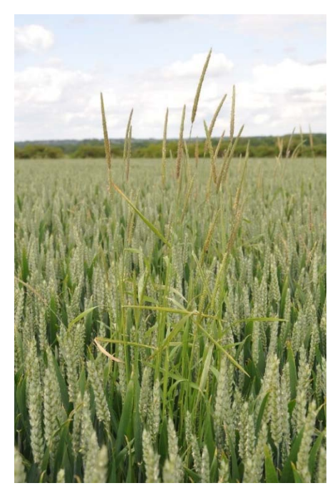
Figure 1. Single black-grass plant emerging above wheat canopy

Black-grass ( Alopecurus myosuroides ), also known as slender foxtail or slender meadow foxtail, is an annual grass with slender stems and hairless, elongated, flat leaves. It can exceed 1 m tall and bears dense, dark purple seed heads 2–12 cm long, tapering at both ends (Figures 1 and 2).