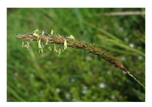
Figure 2. Close up of black-grass seed head at flowering