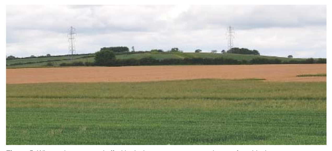
Figure 5. Winter wheat sprayed off with glyphosate to prevent seed return from black-grass, Northamptonshire 2014. Note significant infestation in part of the unsprayed area.