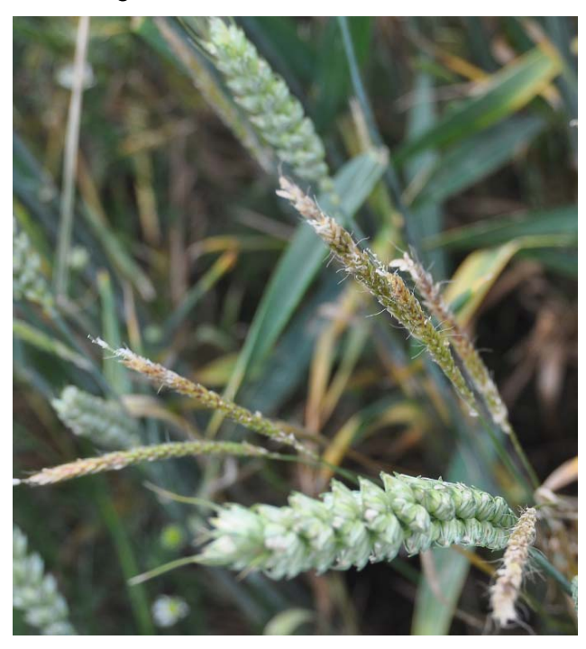
Figure 3. Black-grass heads shedding seed on winter wheat crop. Taken on 2<sup>nd</sup> July in Cambridgeshire.

Seed shed begins in June in England, meaning most of the seed is shed before harvest (Figure 3). Innate seed dormancy is moderately high and is increased by cool damp weather during seed maturation. In ADAS tests between 2001 and 2014, funded by BASF, innate dormancy was 64% on average but varied from 38% in 2001 to 85% in 2008, with significant site-to-site variation.