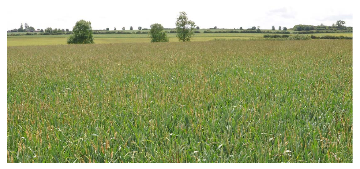
Figure 4. Severe black-grass infestation in winter wheat, Cambridgeshire, July 2014.

Black-grass is now the most prevalent arable weed in England and is causing significant problems to growers across much of the arable area of the south and east, particularly on heavy textured soils. Ideal conditions for black-grass in the 2013/2014 cropping season resulted in severe infestations, with populations of several hundred plants per m² being a common sight (Figure 4). Some growers adopted desperate measures to prevent massive seed return, such as taking the crop for silage or spraying off with glyphosate before seed shed (Figure 5).